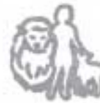
(20) REORGANIZED CHURCH OF JESUS CHRIST OF LATTER DAY SAINTS