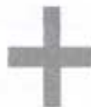
(14) GREEK CROSS