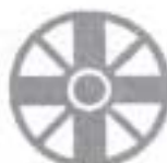
(24) THE CHURCH OF WORLD MESSIANITY (IZUHOME)