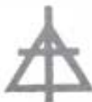
(26) CHRISTIAN REFORMED CHURCH