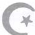
(17) MUSLIM- CRESCENT AND STAR