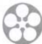
(22) TENRIKYO CHURCH