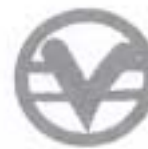
(25) UNITED CHURCH OF RELIGIOUS SCIENCE